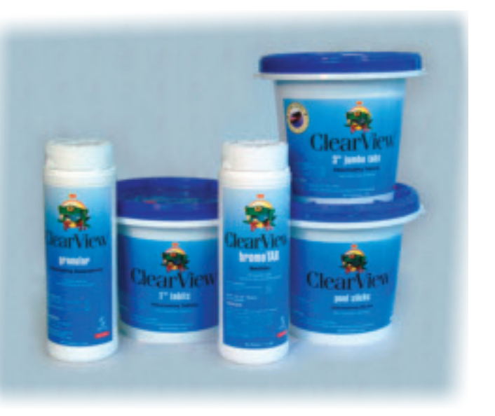
Always carefully read the ClearVIEW label directions before applying any SANITIZER products to your pool. Never mix different products together. If you have any questions about the use of our products, or their application, please contact your ClearVIEW dealer.

Remedy: Add to bromine feeder system as needed to maintain 2.5 to 4.5 ppm bromine residual. Percentages vary between pool and spa requirements. Check with your pool professional for your specific needs.