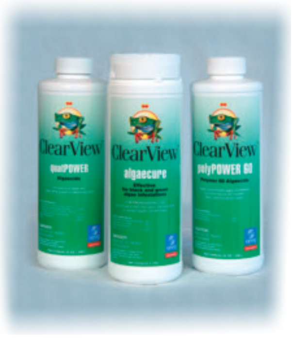
Always carefully read the ClearVIEW label directions before applying any ALGAECIDAL products to your pool. Never mix different products together. If you have any questions about the use of our products, or their application, please contact your ClearVIEW dealer.

Symptom: Black, green, blue or mustard algae on pool plaster surfaces. Remedy: Weekly or as needed to control algae.